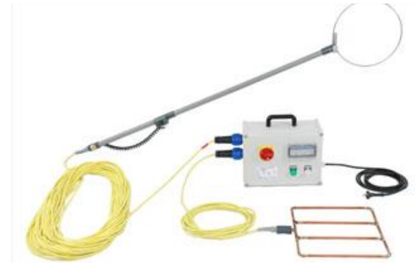
SE 300 is used for wade fishing in smaller streams